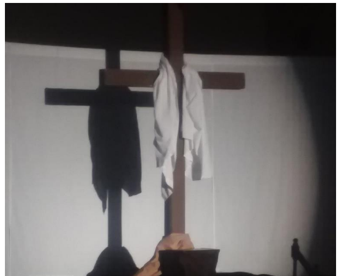
(photo from a previous year's Living Stations of Cross at St. Agatha/Precious Blood parishes)

I wish to end with a message of hope for us all in these difficult times. The best message of hope of which I know is demonstrated in the photo below: the empty Cross